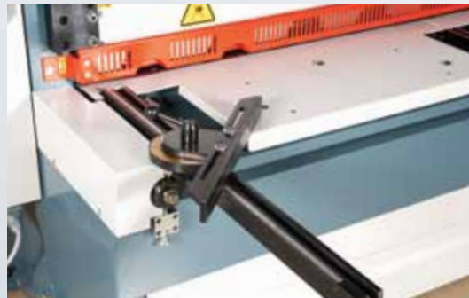
Adjustable Angle Stop 0-180° Finger Guard Ball Transfer Table Hold Downs with Rubber

Backlash-free operation high torques at operating cycles Maintenance free