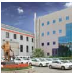
After Sales Service