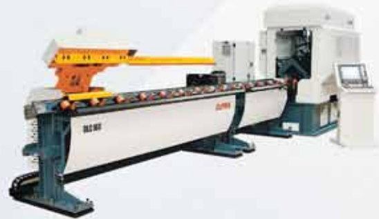
L ANGLE PROCESSING CENTER