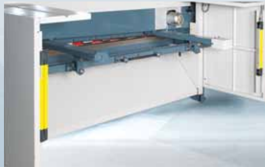
Curtain Light Guards