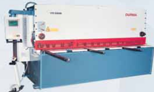
VARIABLE RAKE SHEAR