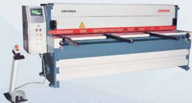
POWER OPERATED SHEAR